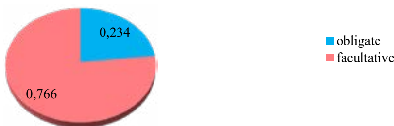
Figure 1. Flora of obligate and facultative calcefites in the Ishkargantau chalk massif, %

Facultative calcefites predominate over obligate calcefites in the Ishkargantau chalk soil studied by us, where populations of the Linaria cretacea plant are found: 23.4% of obligate calcefites are adapted only to chalky soils and 76.6% of facultative calcefites are registered, typical of desert areas that can grow on other soils (Figure 1).